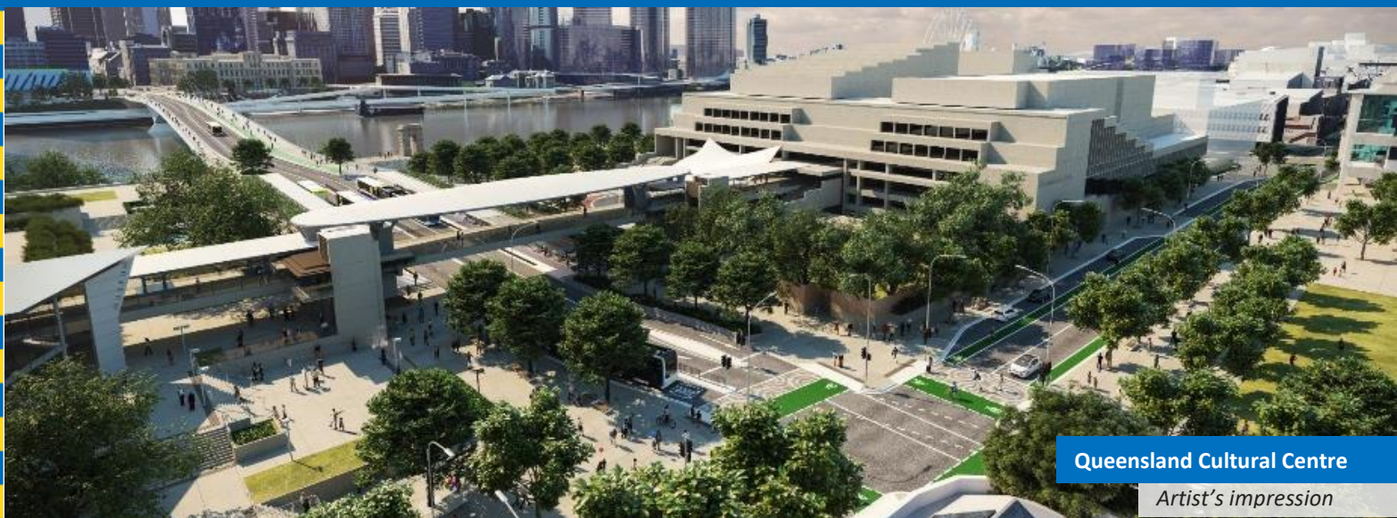
Queensland Cultural Centre